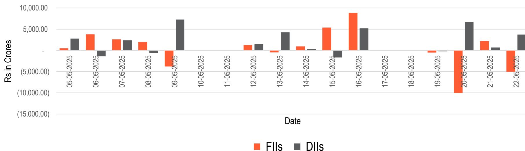
Institutional activity of last 14 trading sessions.